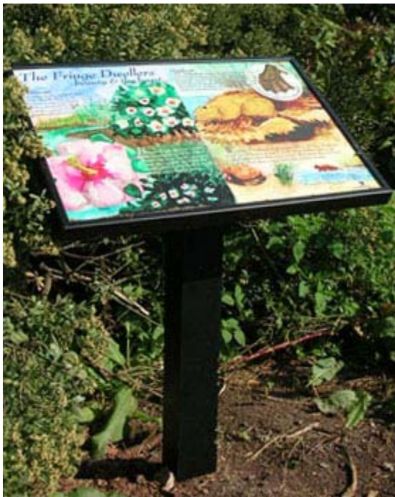
Figure 1 – Single Pedestal Design

Figures 1 and 2 show typical single pedestal and double pedestal designs. The single pedestal design allows a maximum 24" by 24" panel, where the double pedestal design allows a 36" by 24" panel.