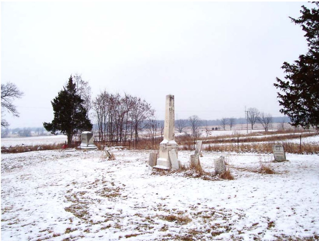
Waters Road Cemetery