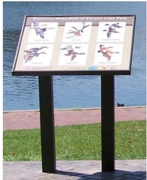
Figure 2 – Double Pedestal Design

We secured quotations from Pannier Graphics for the single and double pedestal models, completely constructed and shipped to Manchester. This quotation is shown in Attachment 1. In addition, we will prepare the information content and artwork for each cemetery sign. The information gathering, presentation and layout will be done by Ray Berg at no cost, and will create the proper Adobe PageMaker™ file format. This artwork file is then electronically submitted to Pannier for printing the signs. We will also have some small expense for the cement footings for the signs.