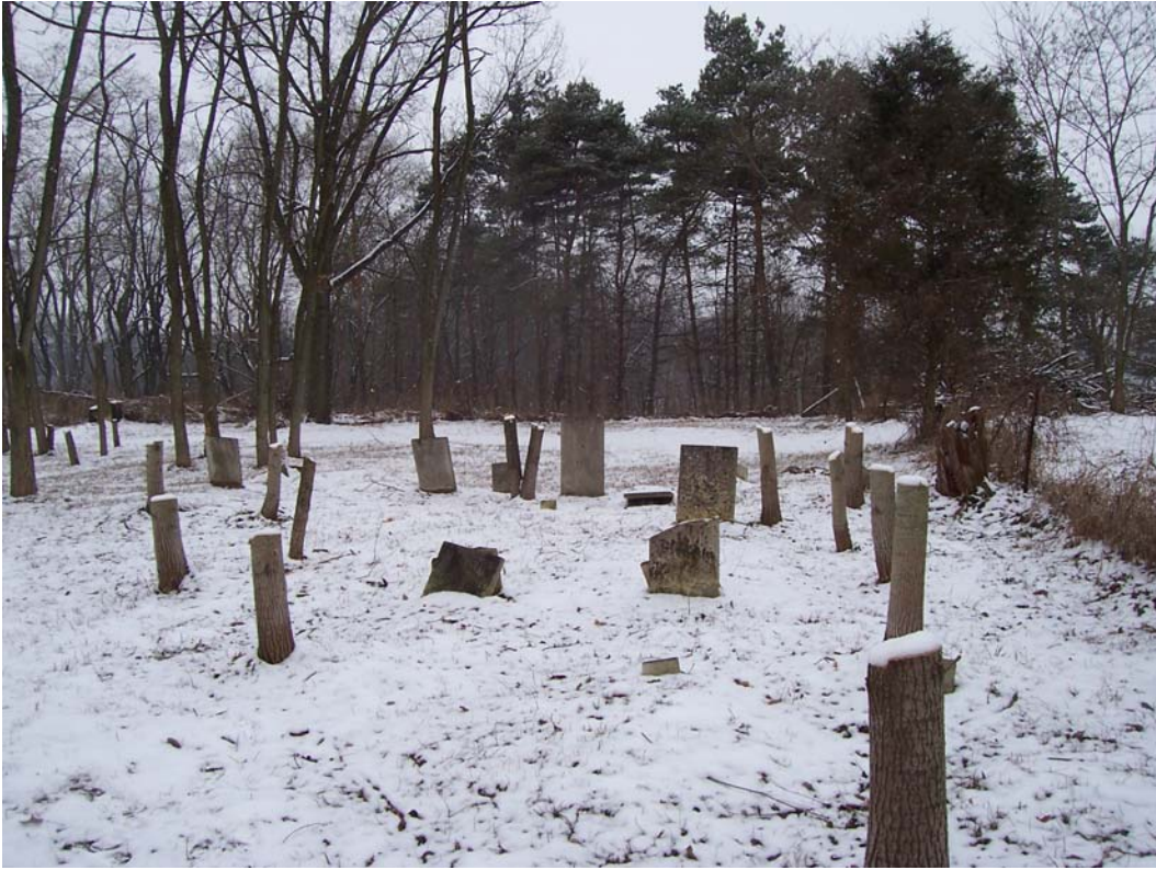
Fletcher Road Cemetery