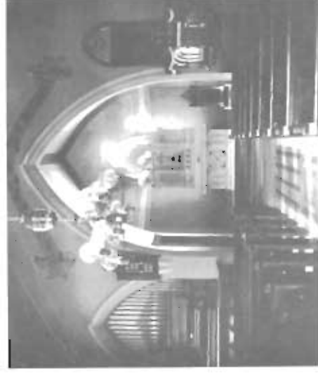
Zion Lutheran in 1917

The congregation met after the catastrophe and decided to rebuild the damaged buildings as soon as possible. Restoration was completed after several months of intense labor and, on September 16, 1917, the rebuilt church was rededicated and Zion celebrated its golden anniversary.