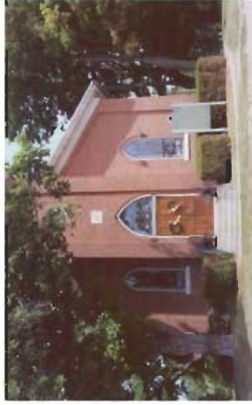
Historic Zion Lutheran Church 3050 S. Fletcher Road Chelsea, MI 48118 734-475-8064