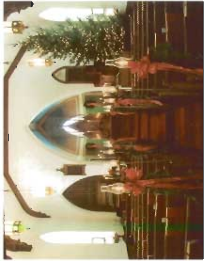
Christmas at Historic Zion