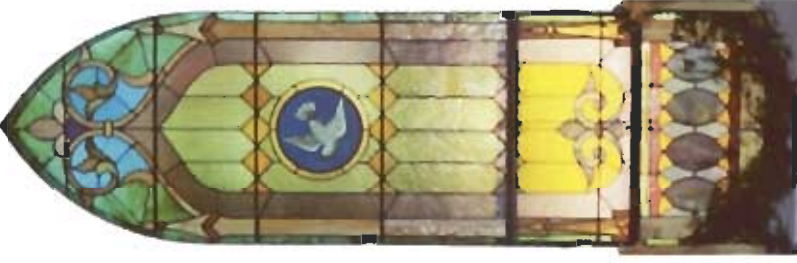
Art Glass Windows