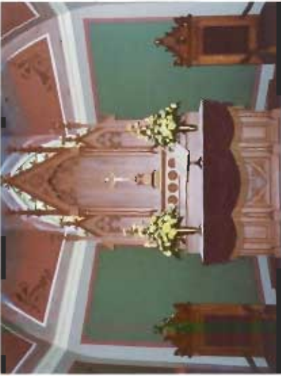
Altar in Springtime